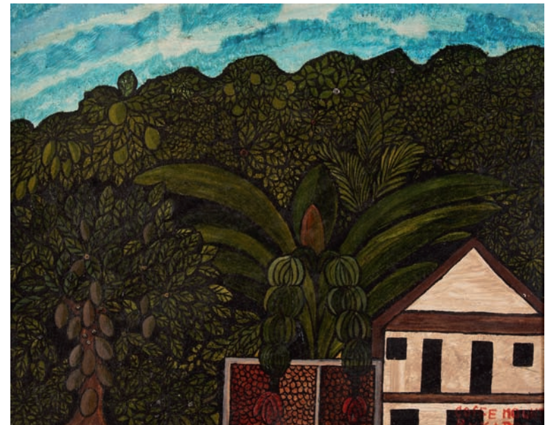
Coffee Mountain Kapo