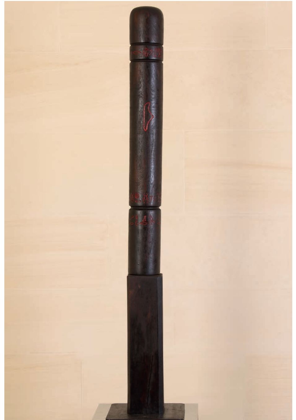
Monumental III Khepera