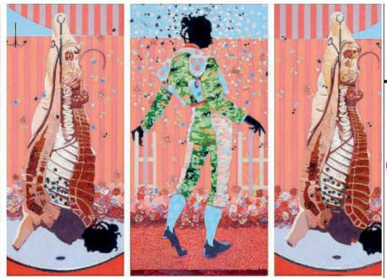
Matador 111 was in the LA Contemporary Art Fair and most recently at a solo exhibition in Sag Harbor.