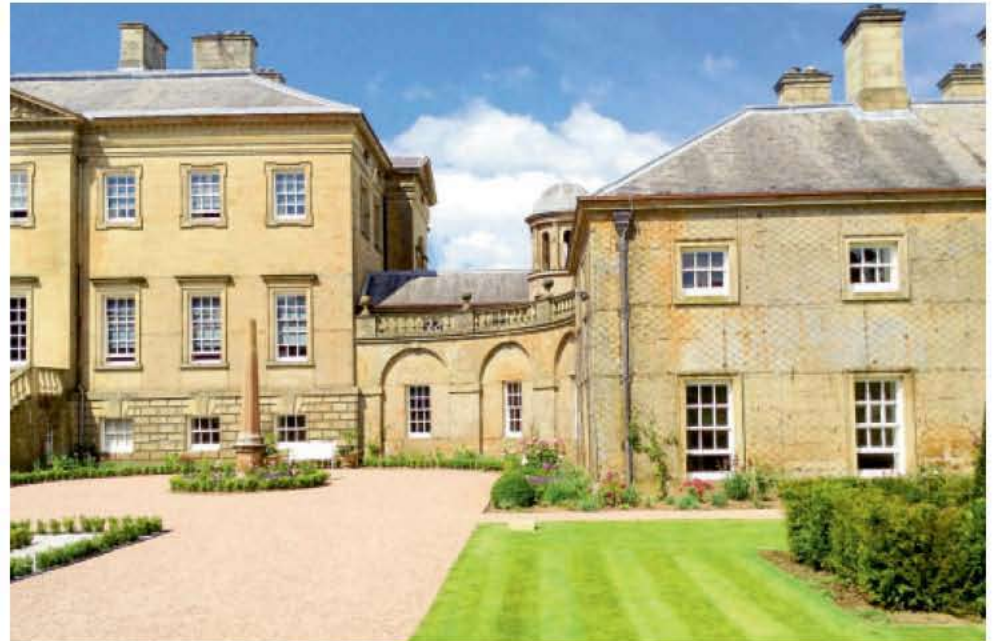
Saved by Prince Charles from the auctioneer's hammer, Dumfries House has been restored to its former glory.